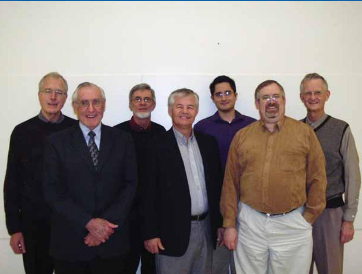
The Board of Directors of Everyday Publications