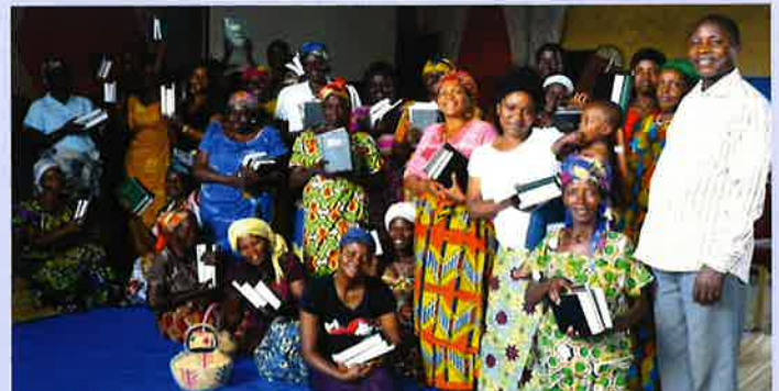
Ladies receiving Bibles and Bible literature in Bunia

road, but that same day, the road was closed because about 7 people were killed on the road. We had to change the plan and fly. Please don't forget us in your prayers. We need them."