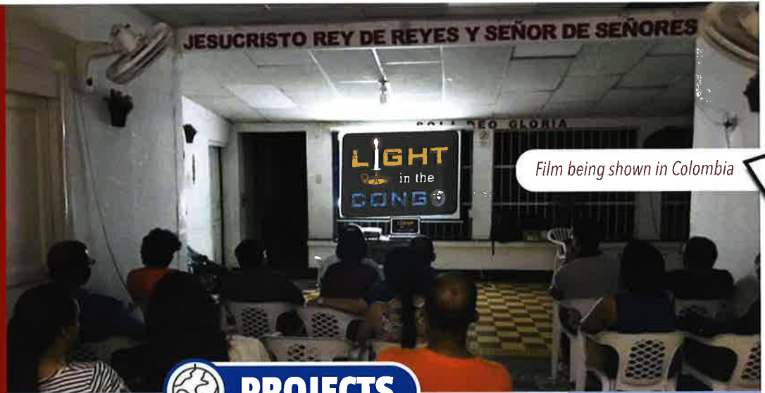
Film being shown in Colombia