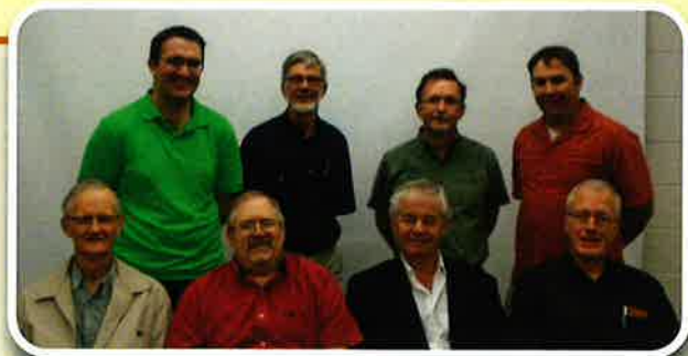
BOARD OF DIRECTORS

...AND THE GOD OF PEACE WILL BE WITH YOU.